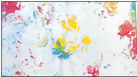
PAWS FOR THOUGHT: The devil's work goes to Belmont Christian College.

DESPITE being painted by a devil, this artwork isn't the least bit